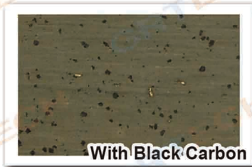
With Black Carbon