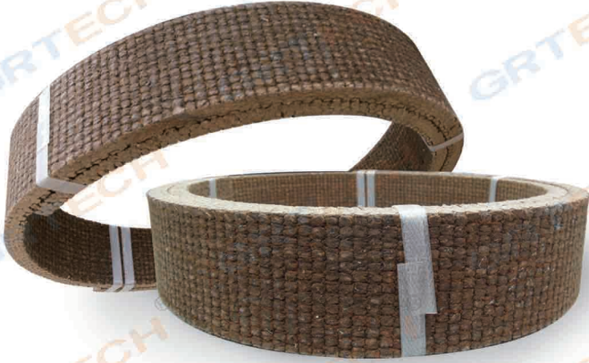
GRT-04 Reddish (Asbestos)

Asbestos Material For Tractor, Agricultural and Engineering Machine