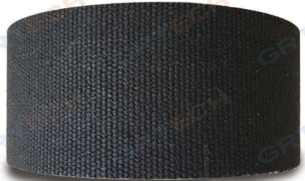
GRT-06 Black (Asbestos)